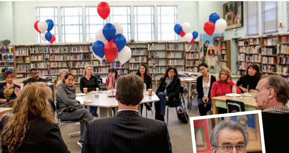
Parents were partners in school change at Woodland Hills and continue to be part of the educational process.