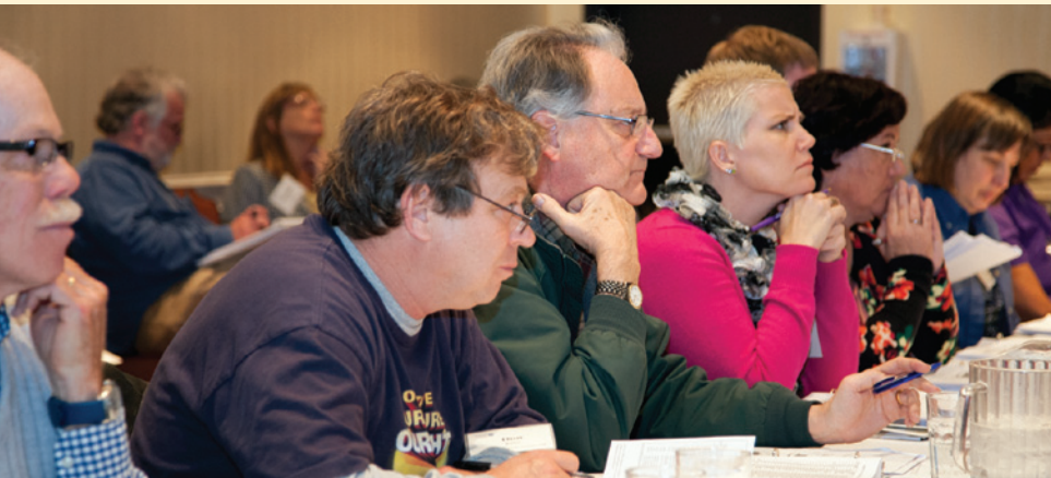
Attendees were eager to learn the nuts and bolts of how to negotiate new funds generated by Proposition 30 that will be arriving to school and college districts soon.