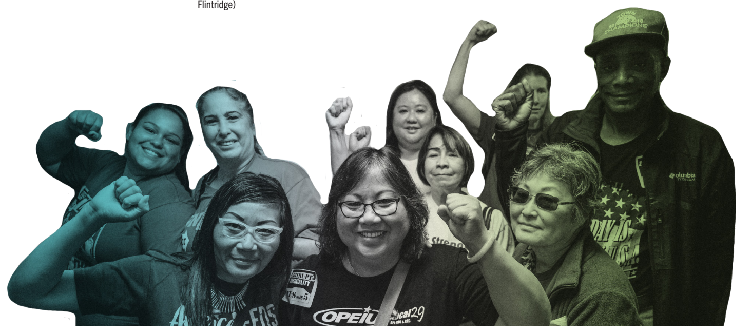
WORKING PEOPLE STANDING TOGETHER #UNIONSTRONG