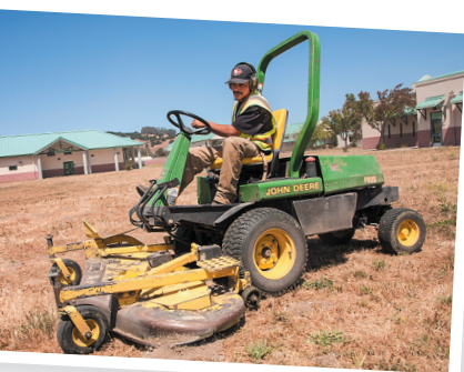
Groundskeeper Isaac Rueda keeps up on weed abatement at Anzar High.

Anzar High is surrounded by broccoli farms and lemon groves, but most growers are