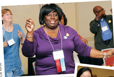
Classified and paras learn and laugh at the annual Classified Conference.

> To learn more, telephone Rosanna Wiebe at 510-523-5238 or visit cft.org/classified .