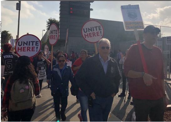
Los Angeles Faculty Guild, Local 1521 joins community members and United Teachers Los Angeles, Local 1021 members in support of the teachers' strike.