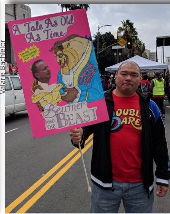
A UTLA supporter proudly displays his handmade sign.