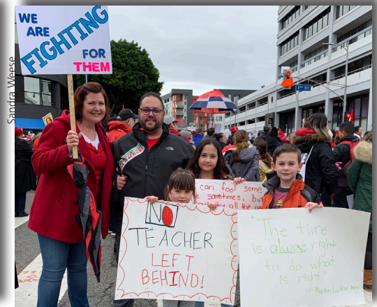
A LAUSD family turns out to support their teachers at the January 15 demonstration in front of the Charter School Association office in L.A.