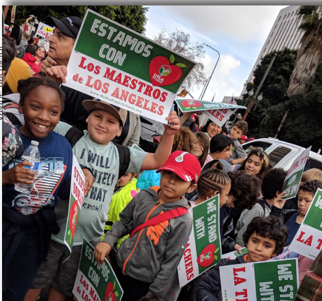
Student and teachers gather for the strike at the midday rallies with UTLA.