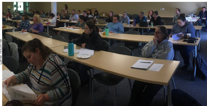
Pajaro Federation of Teachers, Greater Santa Cruz Federation of Teachers, Cabrillo Community College Federation of Teachers, Salinas Valley Federation of Teachers and North Monterey Federation of Teachers co-sponsored a Student Debt Clinic (SDC) on March 14. With over 85 members registered, this was the largest SDC facilitated by the CFT organizing department.