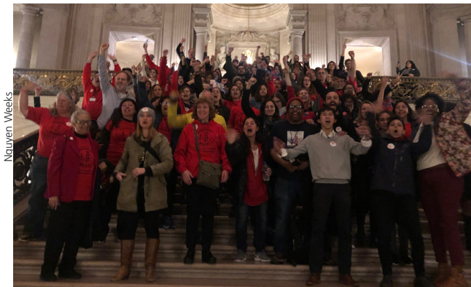
Months long organizing campaign culminates in impressive turn-out as United Educators of San Francisco, Local 61 (UESF) members, parents, students, labor and community allies take their demands to city hall.

Yearly turnover adds more challenges to organizing work in the age of Janus. UESF confronted this challenge by having organizers use Hustle, a one-to-one messaging platform used by many CFT locals in a variety of campaigns. In just two