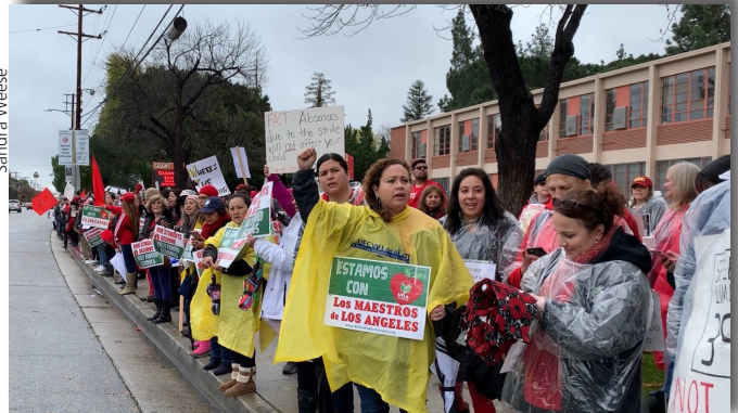
Teachers, community supporters, parents and students rally at Ulysses S. Grant High School.