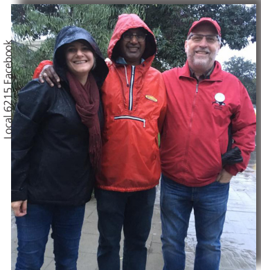
Cerritos College Faculty Federation, Local 6215 members support the strike at Tweedy Elementary School in South Gate.