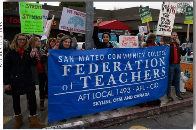
Facebook Local 1493

United Educators of San Francisco, Local 61 (UESF) school psychologists joined the picket line in Oakland because they know how important their services are and how critical it is that all students have access to them if/when needed.