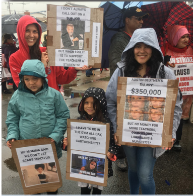
Mother and her three children came out in the rain to support their teachers at a district rally during the strike.