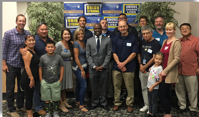
CFT members in Ventura County come together to support Tony Thurmond for Superintendent of Public Instruction at an event hosted by Oxnard Federation of Teachers and School Employees, Local 1273.

educators and fighting to protect public schools in our state, Thurmond ultimately overcame the enormous spending deficit to win with 50.9% of the vote. It was the hardest-fought election of the cycle and the sweetest victory.