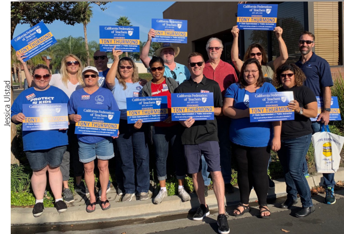
CFT members from Newport Mesa Federation of Teachers, Local 1794; Adjunct Faculty United, Local 6106; and Coast Federation of Classified Employees, Local 4794 turned out on October 27 to canvass labor households for Tony Thurmond for SPI and Gil Cisneros and Harley Rouda for Congress, and No on Proposition 5.

In addition to the incredible wins in congressional races, CFT-endorsed candidates won in every statewide office, electing among others, Gavin Newsom as our state's 40th governor and Democrats took back supermajorities in both the state assembly and the state senate. The most impressive victory and the most critical for public education in our state was Tony Thurmond's defeat of Marshall