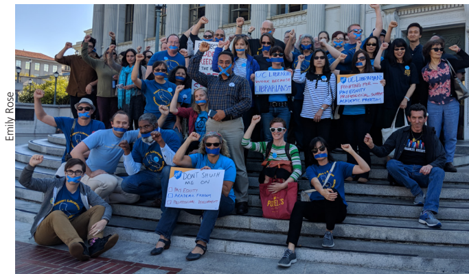
UC-AFT librarians, students and community allies rally on the steps of UC Berkeley's Doe Library.

The organizing committee carefully planned the details of the action. They delegated tasks to individual member activists ranging from media outreach and communications to turning out fellow librarians. Members of the organizing committee had